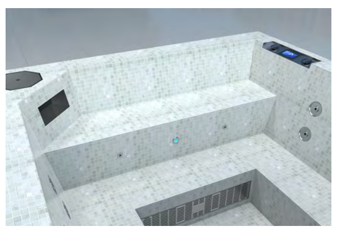
* Features and finishes are subject to change, and may not reflect current available options

ALL STAINLESS STEEL ( above left ) All interior surfaces are finished in a non-directional buffed stainless steel. A modern and clean aesthetic within any setting or decor.