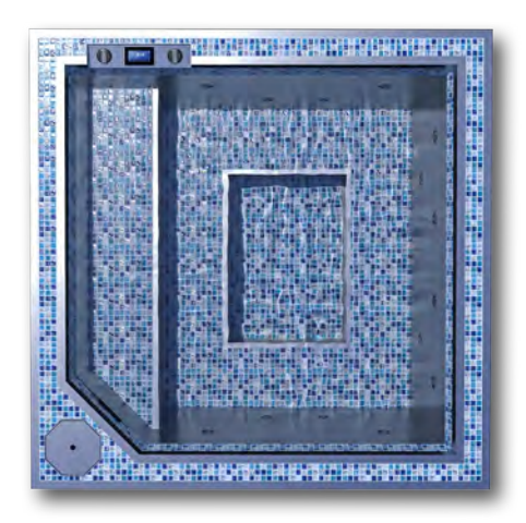
Tile trim finish has a timeless, modern appeal that is a hallmark of the Bradford Signature Series Spas.