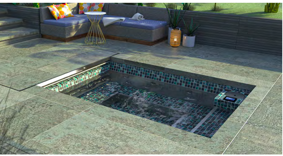
* Features and finishes are subject to change, and may not reflect current available options