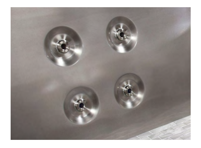
Only Bradford spa jets are 100% stainless steel construction and fully-welded into the spa walls.