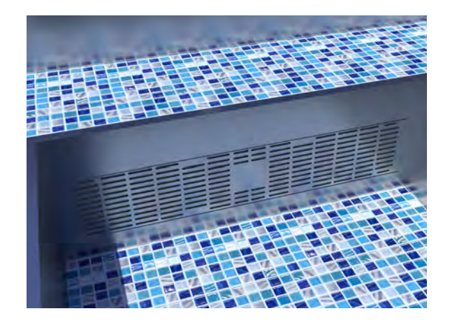
Unique to Bradford Spas is the stainless steel collection port. This reduces the number of visible fittings and drain covers in the spa foot well.