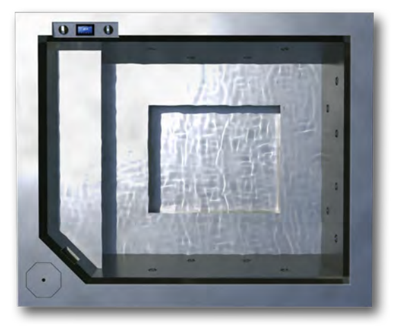
Open, unobstructed bench seating allows all bathers freedom of movement to find their perfect location.